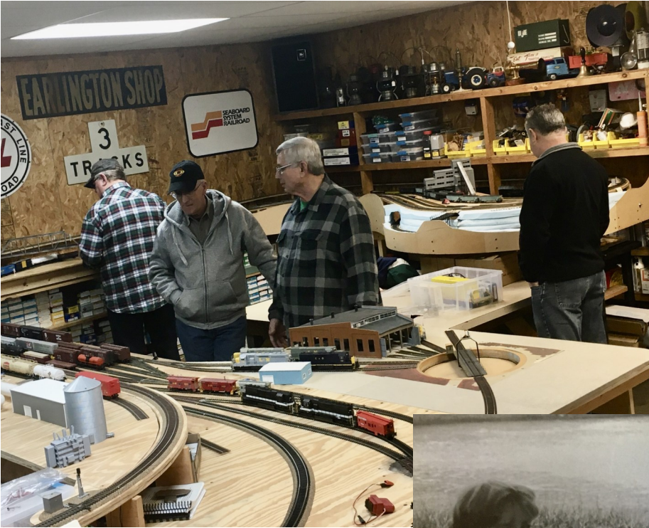
Left: Chapter members enjoy some fellowship and bull talk at the Kittinger's last week.